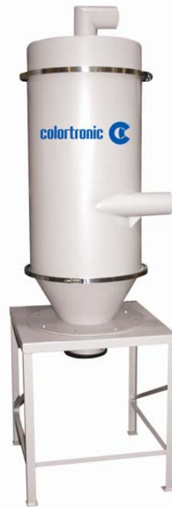
CFC Series Cartridge Style Filter Chamber (model CFC-1000 filter shown)