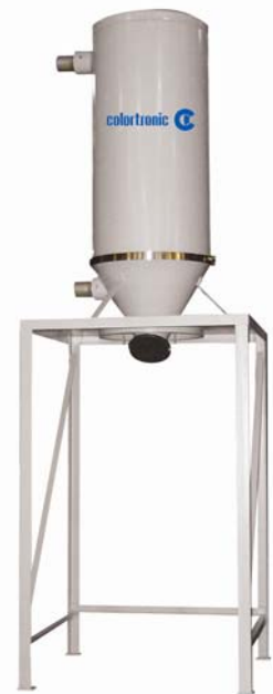
FC Series Bag Style Filter Chamber (model FC-15 filter shown)