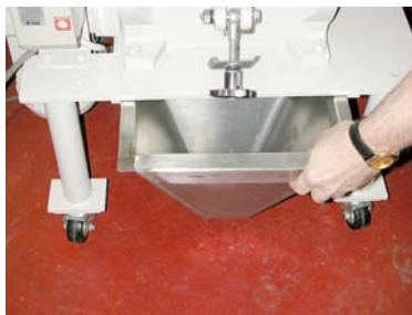
Slide out discharge