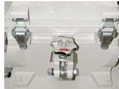
"Tool free" opening for quick access during cleaning